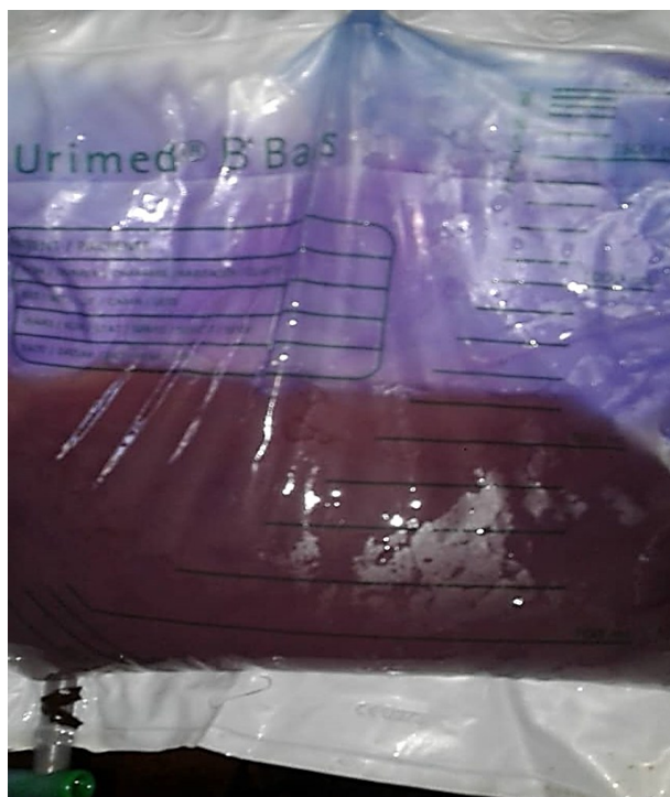
Figure: (1). Purple discoloration of urine bag at presentation