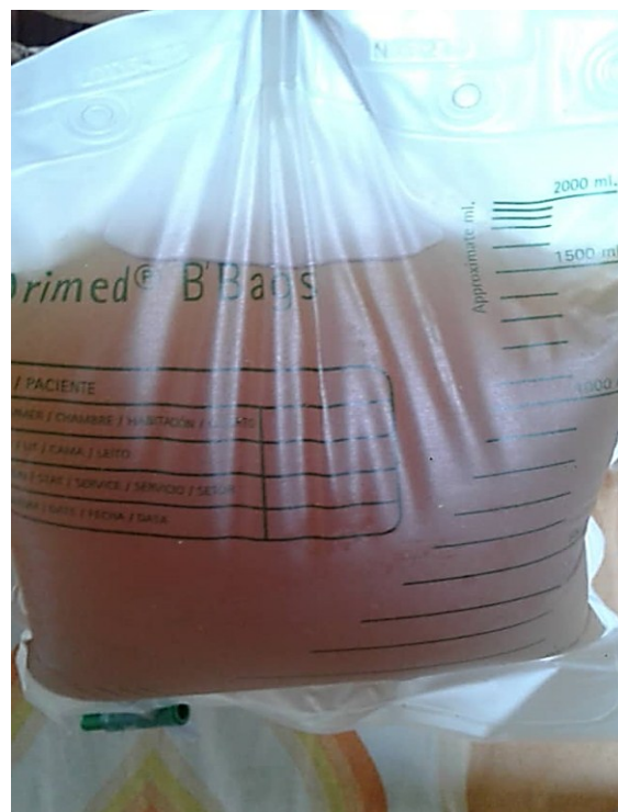
Figure :(2). Urine bag of the same patient after completion of one week of antibiotic therapy.