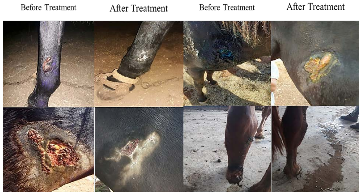
Figure: (2) Wound characterization and healing percentages for fifteen days